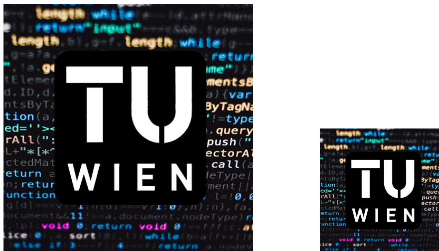
(a) The TU Wien Informatics logo at text width. (b) The TU Wien Informatics logo at half the text width.

An image is added to a document via the \includegraphics command as shown in Figure 3.1. The \subcaption command can be used to reference subfigures, such as Figure 3.1a and 3.1b.